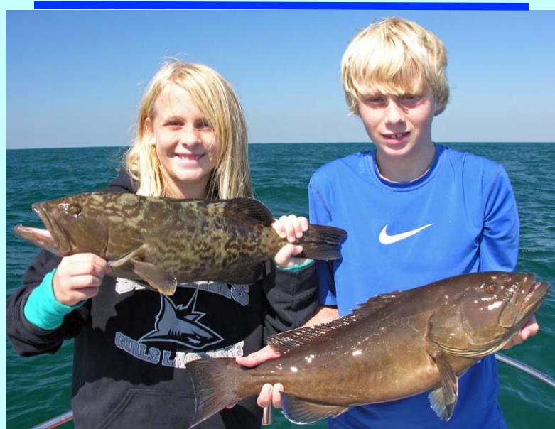
The Kiel Kids had a good day off Cedar Key catching dinner for everyone!