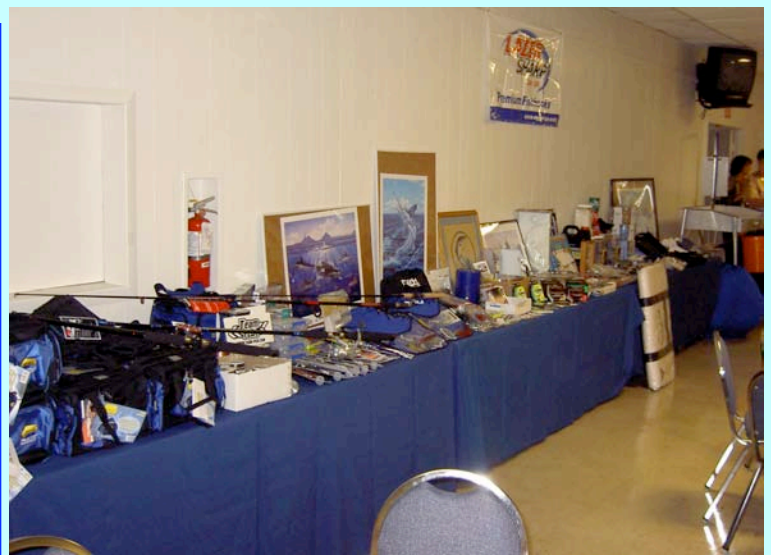
Here are a couple of Photos of just some of the great raffle prizes that we have at the Annual Awards Banquet.

This is the one great party that you really don't want to miss! As you can see, not a coat & Tie affair but everyone dresses nicely, Good food and GREAT and Plentiful raffle prizes!