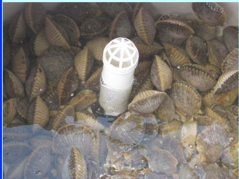
A live well full of DINNER!