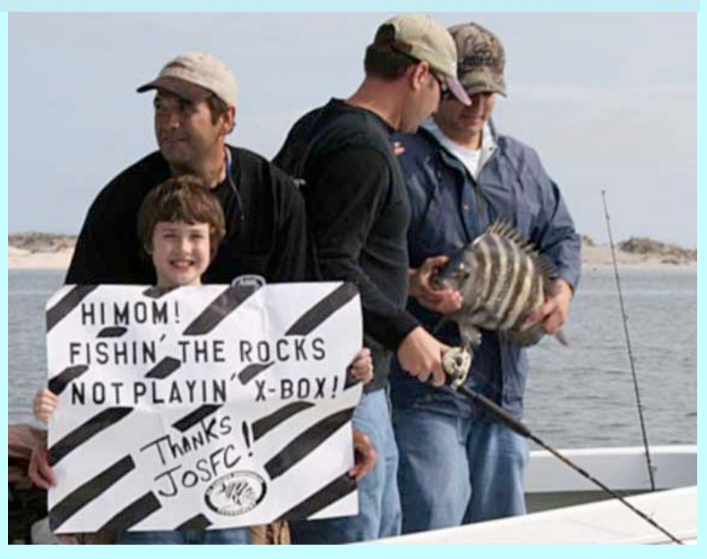
This picture should have been on the front page of the Times Union Newspaper!

The standings for places 16 through 92 can be found on the JOSFC Web-Site www.jaxfish.com