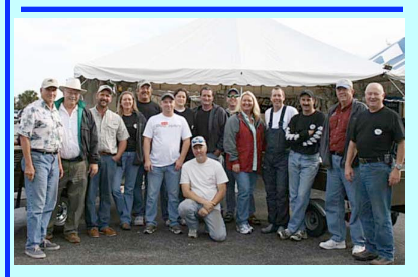
Here are some of the people that made it all possible.