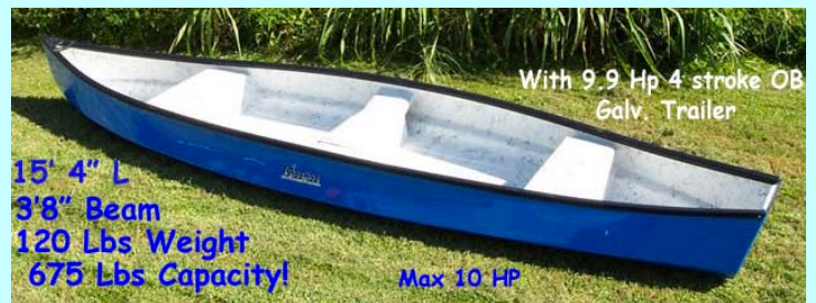
How is this for the El Cheapo's 3rd place prize! A 15'4" Gheenoe with a 9.9 Hp 4 stroke motor on a Galvanized Trailer. This is presented by Atlantic Coast Marine!

If you catch a Red Snapper with a Tag in it's back, PLEASE, note the (1) Tag Number, (2)Date & time caught, (3) Location, (Numbers will not be released or published) (4) Pinched tail length, (5) Released or Kept. Optional info wanted, Type of bait used, Released condition, Vented or not or killed by a predator, and hook location, Lip / corner of mouth / gut / Gills. and was the hook removed. Then Call 1 - 800 - 367 - 4461 with that info. JOSFC encourages participation in this program!