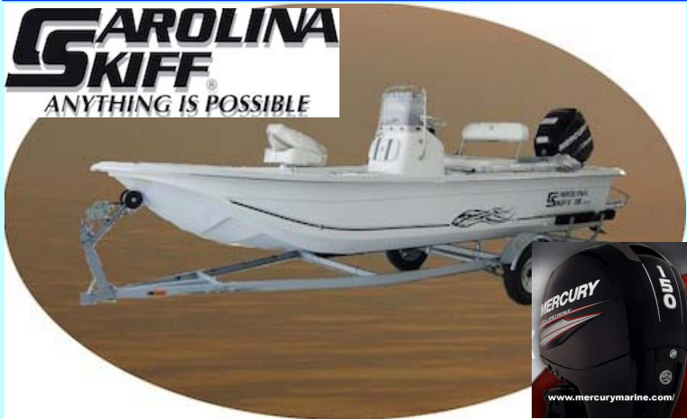
First Place in the El Cheapo wins a Carolina Skiff JVX-18 Center Console with a 60 HP MERCURY 4 stroke, on a Magic Tilt Trailer.