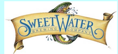
SweetWater Brewing has covered 4th Place with a stand up Paddle Board, Kayak, and soft side Cooler!