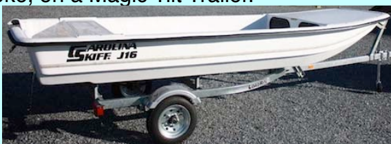
Second place presented by Dell Marine, a Carolina Skiff J-1650 Tiller with a 30 HP Mercury 4 stroke on a Magic Tilt Trailer.