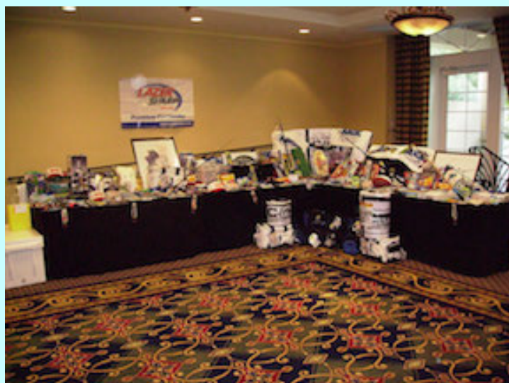
The Biggest Raffle for Banquet attendees only!